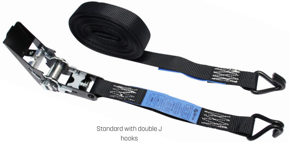
Standard with double J hooks